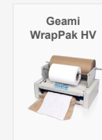
Geami WrapPak HV